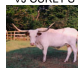
VJ CURLY'S GIRL