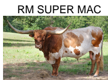
RM SUPER MAC