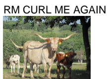
RM CURL ME AGAIN