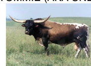
VJ TOMMIE (AKA UNLIMITED)