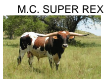
M.C. SUPER REX