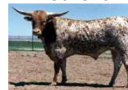
Kickapoo Farms 185